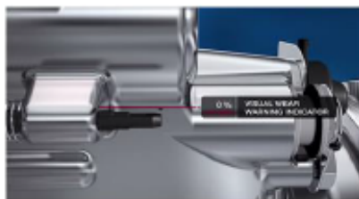
EX+ Disc Brake

Easy visual to read wear versus 'eyeballing' a notch in the caliper